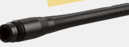
.50cal. Breech Insert + Barrel

For players, down time cleaning their gear is time they aren't out having fun. For field owners cleaning and maintaining the rental fleet is a necessary part of business, but when it's complicated it ties up staff. Fast and easy maintenance means more fun for players and more time for field owners to focus on their customers.