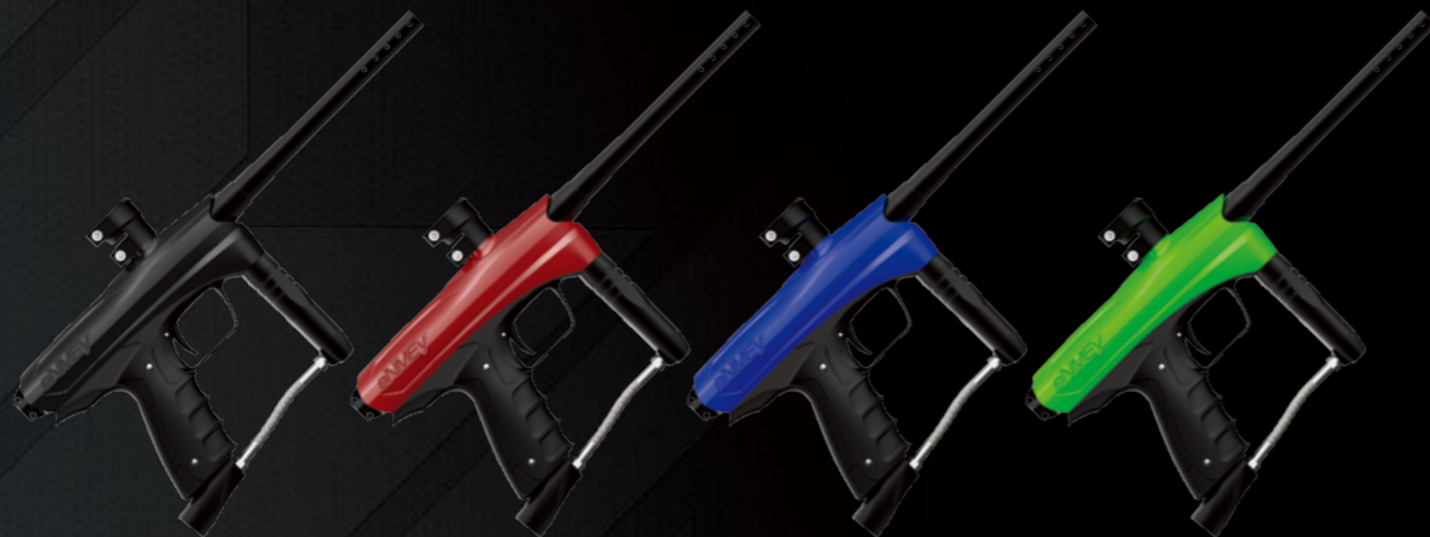
JET BLACK /// RACER RED /// RAZOR BLUE /// FREAK GREEN