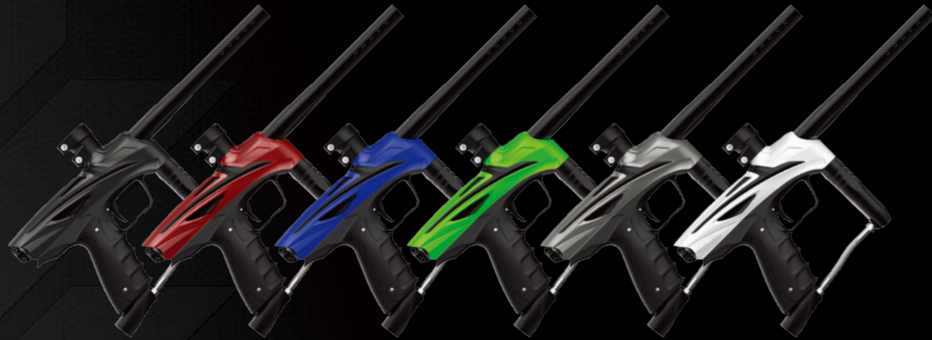
JET BLACK /// RACER RED /// RAZOR BLUE /// FREAK GREEN /// TITANIUM SILVER /// RALLY WHITE

Glossy hard composite shell with black rubber accent